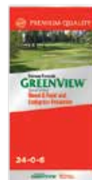
Fertilizer, Weed Control and Crabgrass Preventer