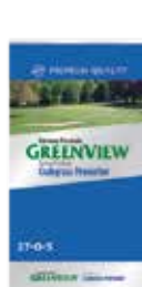
Fertilizer and Crabgrass Preventer