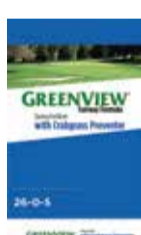
Fertilizer and Crabgrass Preventer