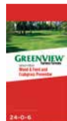
Fertilizer, Weed Control and Crabgrass Preventer